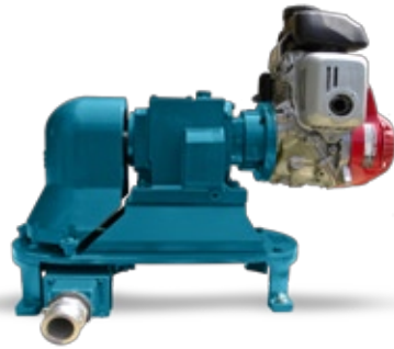
2FA-M™ STANDARD PIPING