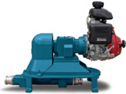
2FA-M™ OPTIONAL IN LINE PIPING