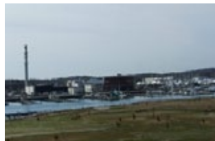
Tern Harbor Marina Includes a 35 ton travel lift and features a face dock accommodating yachts up to 110 ft.