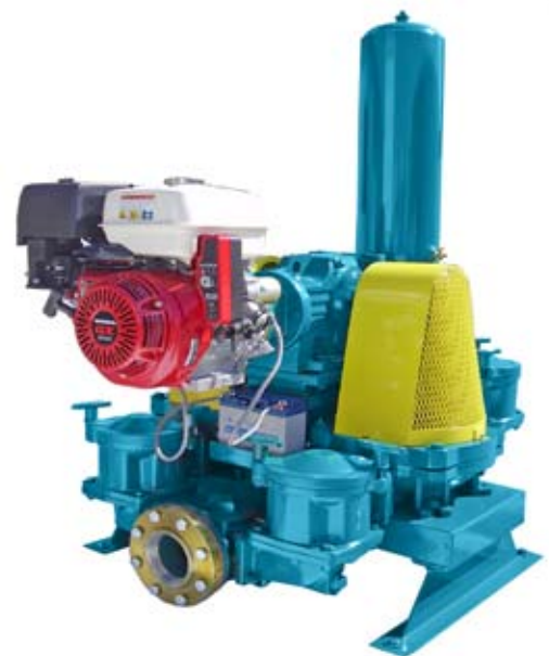
BDD-M Engine Driven Auto-Start